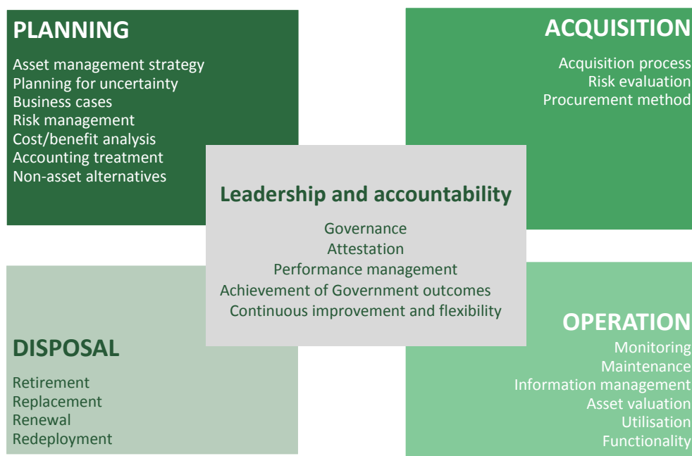
Figure 4: The AMAF asset lifecycle

In addition to overarching leadership and accountability elements, the stages through which an asset generally passes during its life are the: