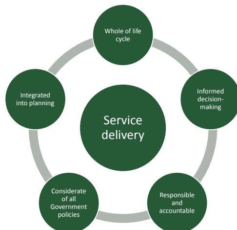
Figure 3: Service delivery is at the core of asset management